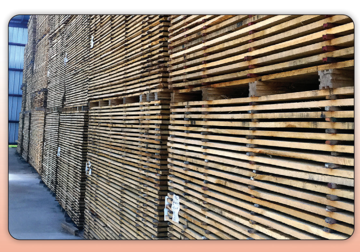
An example of proper sticker placement for stacking lumber.

Proper lumber stacking for drying improves air circulation, uniform drying, and reduces drying defects.