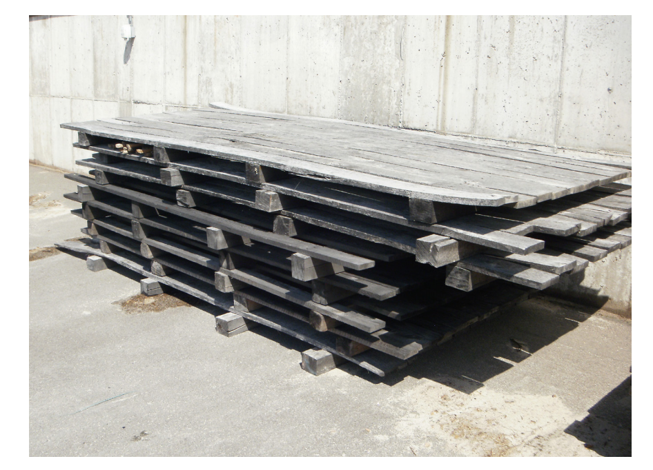
Figure 2. Pile covers fabricated with low-grade lumber fastened to small pallet cants.

Species such as ponderosa pine (Pinus ponderosa) and hard maple (Acer saccharum) are especially susceptible to darkening of the wood color which can substantially lower the market value of the lumber (Dawson-Andoh et al. 2004, Wagner et al. 2008). Ultraviolet light from the sun is a significant contributor to undesirable changes in lumber color (Kreber 1994). Pooling of water on lumber surfaces from rain or snowmelt can also be a factor in