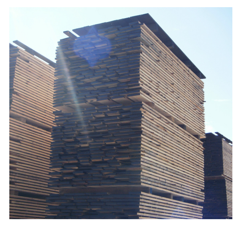
Figure 4. The boards missing from the pile covers in the above photograph can easily be replaced with low-grade lumber that is generated at the sawmill.

Lumber pile covers can be created by affixing uniform thickness and variable width boards to uniform sized small dimension cants. The purpose of consistent sizes and materials is to have uniform weight distribution across the stack. The pile covers illustrated in Figure 4, are neither providing uniform distribution of fully protecting the lumber piles from the elements due to missing boards. To fully realize the protection that the pile covers can provide, the boards will need to be replaced. When low-grade lumber is used, the cost to repair the damaged pile covers is minimal. Other material choices can be more costly and likely not as easy to repair. Doubling the layers and overlapping the seams can add additional protection to help prevent the pooling of water on the lumber surfaces being protected by the pile covers.