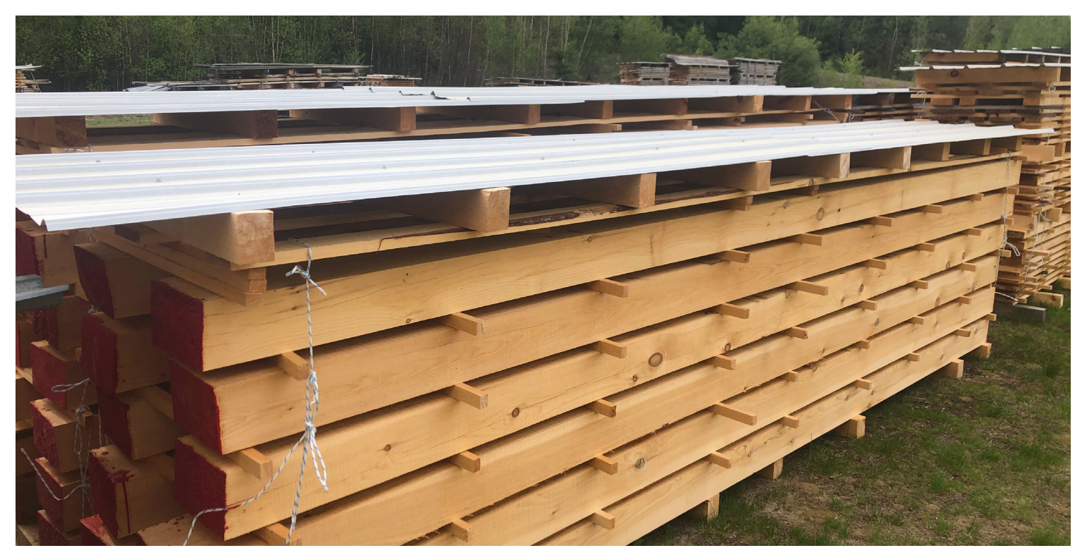
Figure 3. Example of tie-downs to secure pile covers in place and prevent movement.

the importance of using pile covers to preserve lumber quality and in turn lumber value.