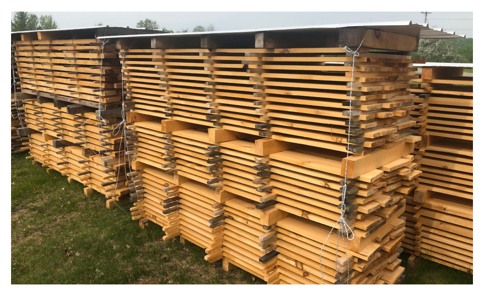
Figure 1. Pile covers in an air-dry yard help preserve the quality and value of the lumber by protecting the lumber from the elements.

Degrade or loss of value of lumber stored in air-dry yards typically range from $21 – $54 per thousand board foot (MBF) and can easily reach $150 per MBF in poorly operated air-dry yards (Wengert 2006). Use of pile covers on stickered lumber, such as the ones shown in Figure 1, help to protect the top courses of lumber from undesirable discoloring and staining associated with sunlight and precipitation (Rietz 1970). Lumber